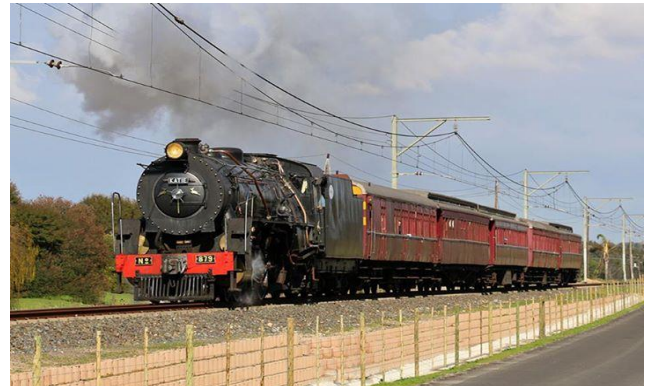
Atlantic Rail 4-6-2 “Katy”

During a winter break in Cape Town, my wife and I did some investigating and discovered a heritage steam railway run by volunteers. On a number of Sundays in the holiday season, they run steam train trips from the main station in Cape Town. Departing from the hotel at the station, a vintage SAR Class 16DA steam locomotive number 879, built in 1929 named Katy with period wooden coaches travels through the winelands en-route to Stellenbosch.